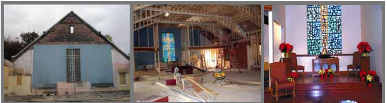
The Sanctuary is Reborn!