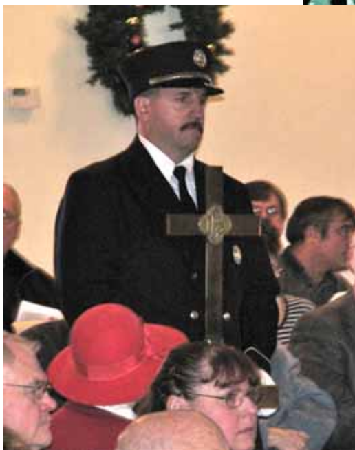
The Cross comes home to the Altar on Saturday, December 10, 2009 May God Bless our Firemen!