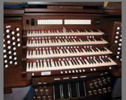
The organ arrives and Jim can't even wait till it's unwrapped!