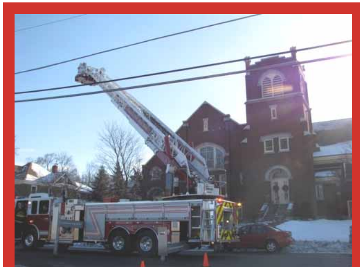
Massena Fire Dept. proudly displays their new ladder truck at our Rededication Service