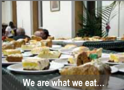
We are what we eat... At the Harvest Dinner!