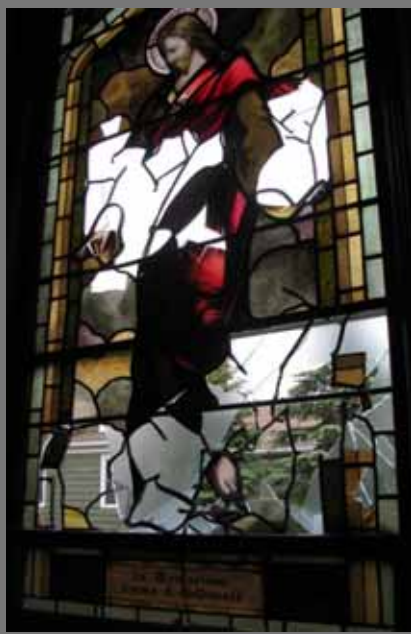
The shattered Jesus window is recreated from photos.