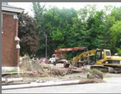
From the newly dug hole, emerged a new entrance with elevator.