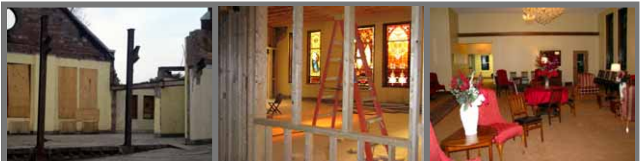
The Guild Room comes back as the Unity Room