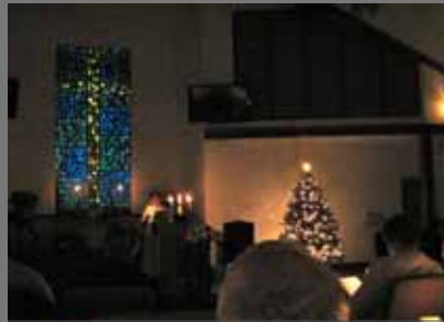
Together we gave thanks...