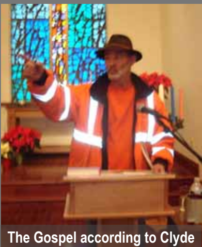
The Gospel according to Clyde