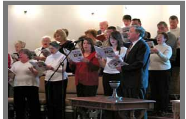
St. Johns joins our choir for the Rededication