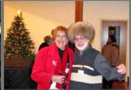
...and made fashion statements