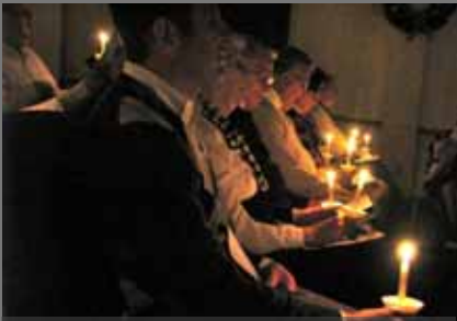
A candlelit Christmas Eve.

There was a lot more that happened in addition to our building project!