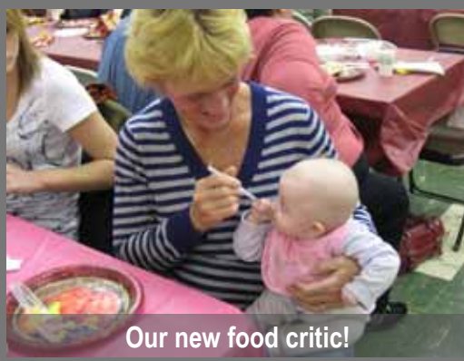
Our new food critic!