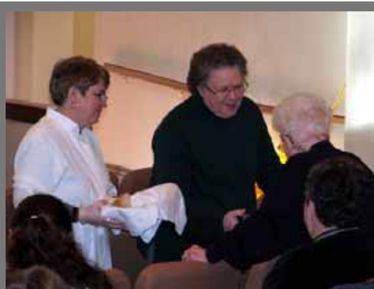
1st Communion in the New Old Church!