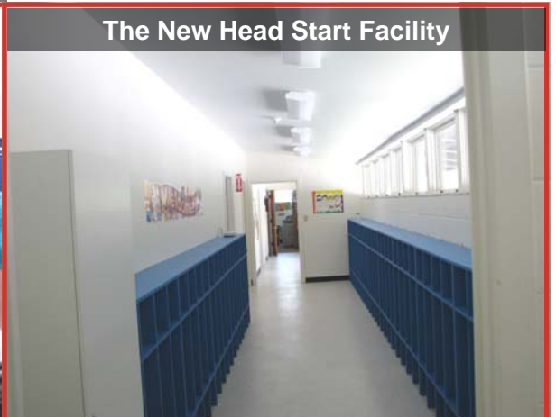
The New Head Start Facility