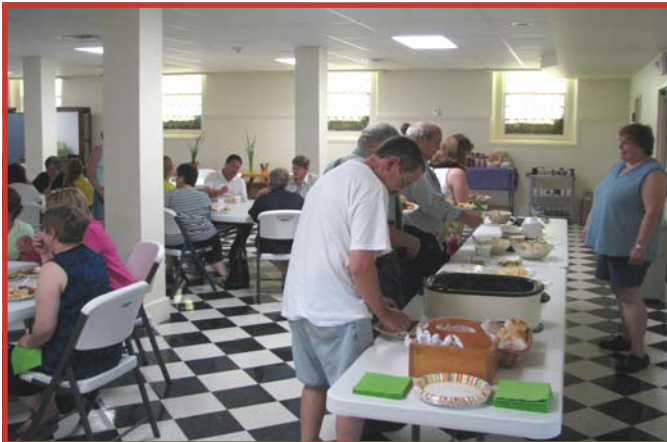
We served a Welcome Luncheon to the staff of Massena Head Start on Friday, June 18th. Head Start is using the Christian Ed. Building for their program! Many improvements and updates have been done to the building by Head Start and Emmanuel to accommodate their program. WELCOME!!!