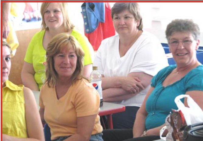
For more graduation announcements, see page 2